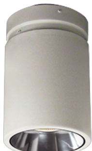
Dark Mirror Reflector