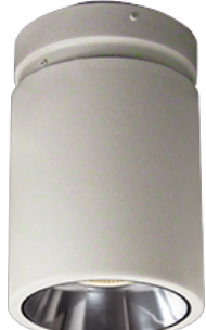
Dark Mirror Reflector