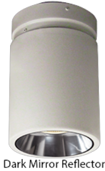
Dark Mirror Reflector