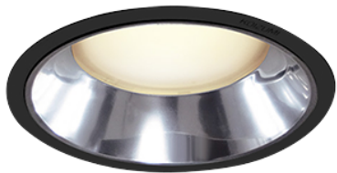
Dark Mirror Reflector