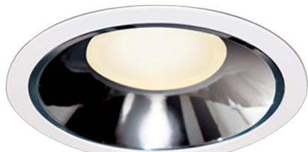
With Dark Mirror Reflector