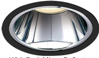
With Dark Mirror Reflector