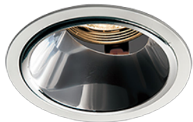
Dark Mirror Reflector

Series Name: Cledy versa R-G Antiglare (DD136-AG-R)