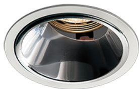
Dark Mirror Reflector

Series Name: Cledy versa R-G Antiglare (DD136-AG-R)