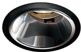
Dark Mirror Reflector

Series Name: Cledy versa R-G Antiglare (DD136-AG-R)