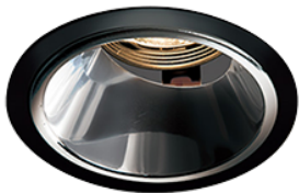
Dark Mirror Reflector

Series Name: Cledy versa R-G Antiglare (DD136-AG-R)