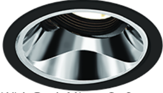
With Dark Mirror Reflector

Series Name: AMMA High-efficiency Lens type Antiglare downlight (DD155-AG)