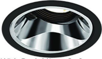
With Dark Mirror Reflector

Series Name: AMMA High-efficiency Lens type Antiglare downlight (DD155-AG)