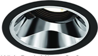
With Dark Mirror Reflector

Series Name: AMMA High-efficiency Lens type Antiglare downlight (DD155-AG-FX)