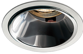
Dark Mirror Reflector

Series Name: Cledy versa L-G Antiglare (DD146-AG)